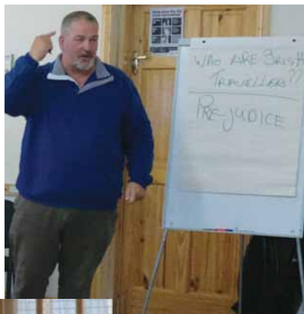
Workshops with Travellers in Irish Prisons

The Trust has a policy of seeking reports from organisations in receipt of grants when the money has been spent normally a year following grant allocation. From this information the Trust writes up overall impact reports. Strategic grant programmes generally have a formative evaluative approach which documents the learning of grantees on an ongoing basis. The purpose is to learn from the work of grantees and to help organisations reflect on the project, whether it changed from the original intentions and if so, why. In addition, gathering information from grantees allows the Trust to reflect on the efficiency and effectiveness of its grant making approaches and process and overall outcomes.